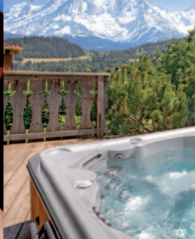
Outdoor hot tub